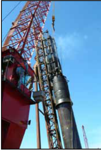
D220-42 With a 2.5 m Bottom Drive.