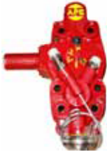
Optional Variable Throttle Control.