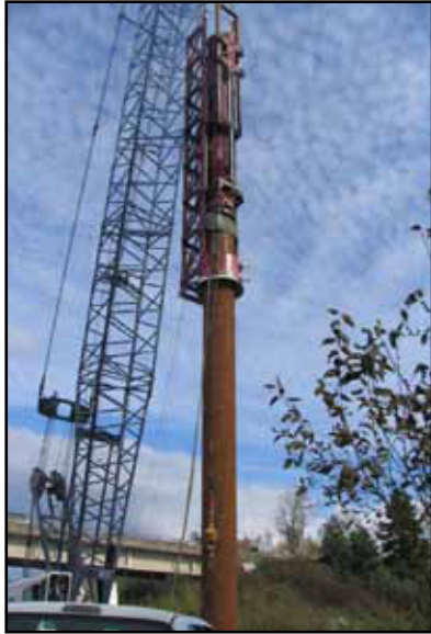
D180-42 driving 48" piles with a 54" offshore.