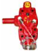
Optional Variable Throttle Control.