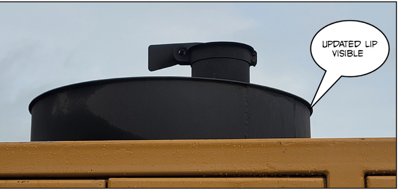
Option #2 - Welded Plate Example