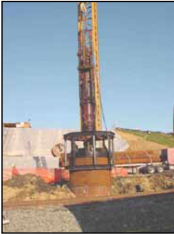
D100-42 in a bottom drive.