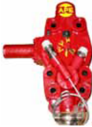
Optional Variable Throttle Control.