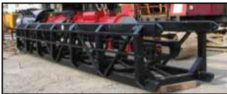
Typical 54" offshore.